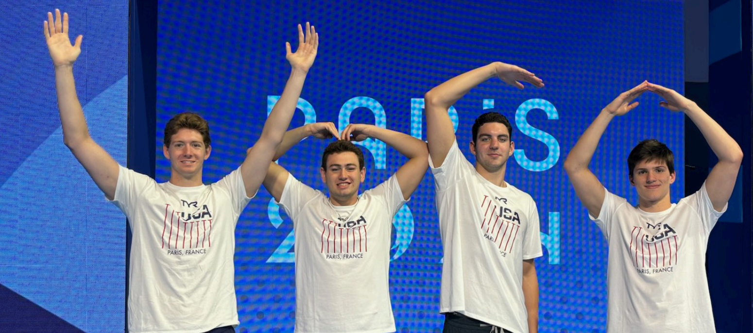
Pictured are Chris Guiliano, Matt Fallon, Jack Alexy, Thomas Heilman